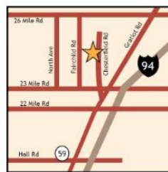
CHESTERFIELD TWP., MICHIGAN

122 54th St. Grand Rapids, MI 49548 Fax: 616-532-7574