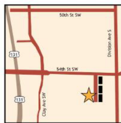
GRAND RAPIDS, MICHIGAN

3431 N. Jennings Rd. Flint, MI 48504 Fax: 810-785-9458